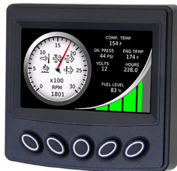
Sullivan-Palatek Electronic Controller (SPEC)