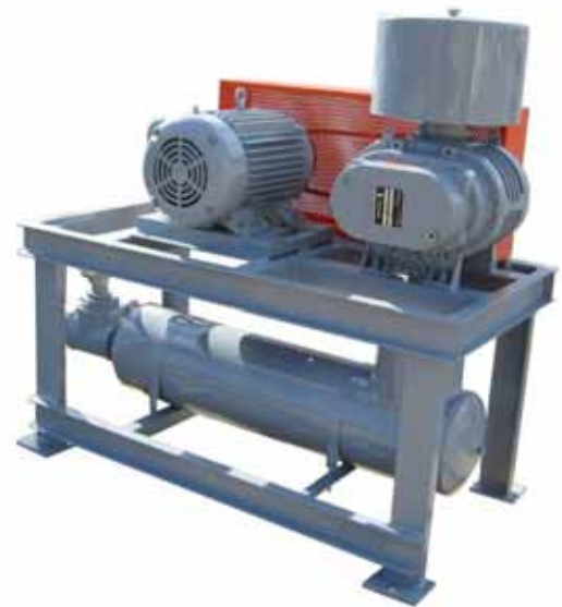
TT-6M-30 Belt Drive