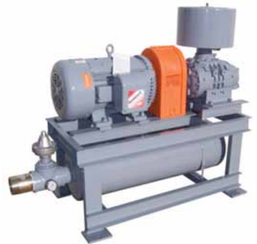
TTD-4506-50 Direct Drive