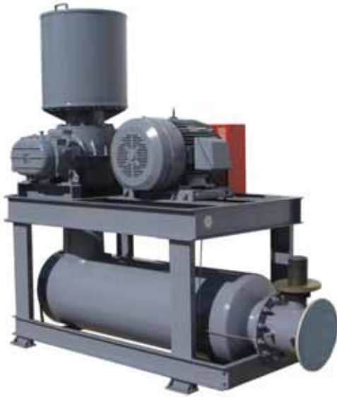
TT-7028-150 Belt Drive