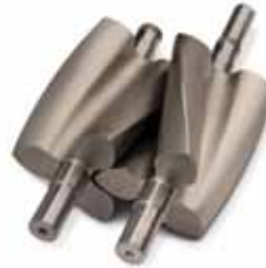
Tri -lobe Helical