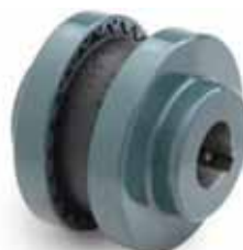
Direct Drive Coupling