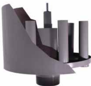
Inlet Filter Silencer