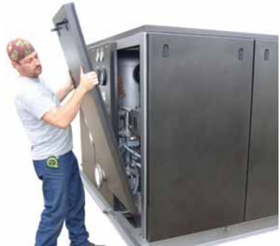
"Lift Off" Panels

Superior noise levels are achieved through a combination of design elements. Proper blower selection, premium quality silencers, and sound reduction enclosure deliver a very quiet package.