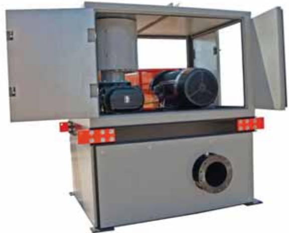
Q-7028-200 Doors Open

Superior noise levels are achieved through a combination of design elements. Proper blower selection, premium quality silencers, and sound reduction enclosure deliver a very quiet package.