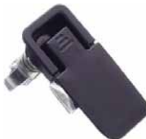
Quarter Turn Compression Latch