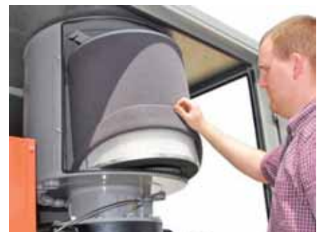
Easy Filter Access