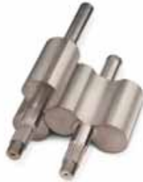
Two - lobe Straight