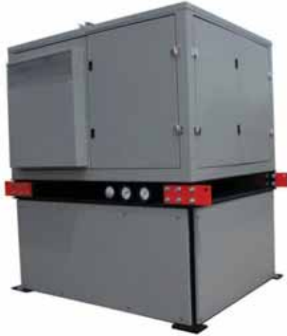
Q-7028-200 Doors Off (Lift off hinges)