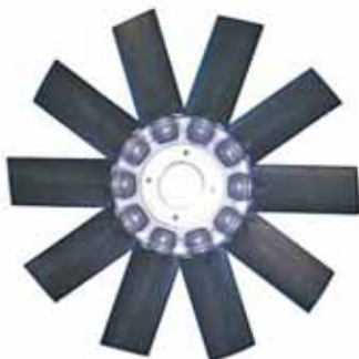
Forced Air Cooling