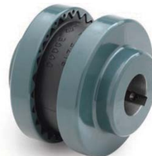
Direct Drive Coupling