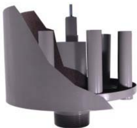
Inlet Filter Silencer