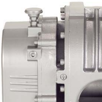
Engineered Air Gap

The air gap between the lubricant sump and the impeller cylinder reduces temperatures up to 15° F extending lubricant, bearing and blower life.