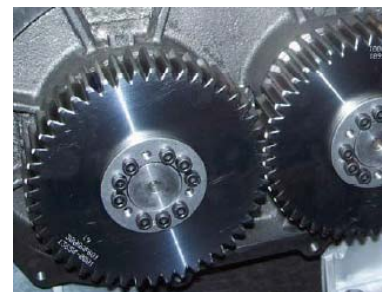
Gear Locking Rings

Timing gears are mounted with Grip Rings which expand against the bore and compress on the shaft for a secure, mechanical shrink fit. with a 6.0 safety factor.